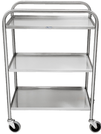
Dimensions: 27 1/2" x 40" x 18 1/8"

Description: Our versatile medium duty carts easily move records, supplies and equipment throughout your facility. They are made of 16GA stainless steel, have three solid shelves with lipped edges on all four sides, travel on four 4" swivel casters and have a weight capacity of 500 lbs. evenly distributed. Choose between our design that includes four sided shelves and width-wise handles or our design that includes open shelving and depth-wise handles. Optional IV pole attachment is available.