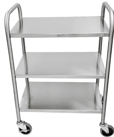
Dimensions: 25" x 35 3/4" x 16 1/2"