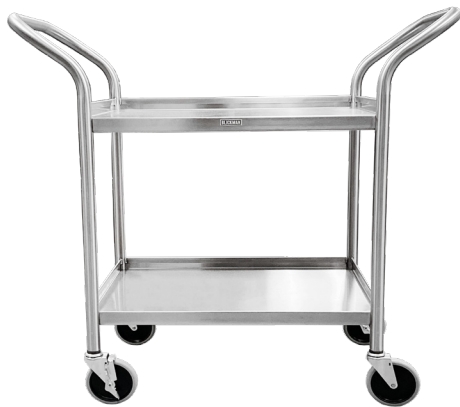
Dimensions: 41 3/4" x 40" x 19 1/4"

Description: Our heavy duty cart with angled push handles is made of 16GA stainless steel, has two solid 4-sided shelves, travels on four 5" swivel casters and has a weight capacity of 700 lbs. evenly distributed. Optional IV pole attachment is available.