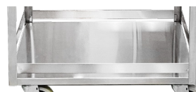
Shelf with 4 Guardrails