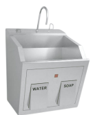
Height 39 1/4"