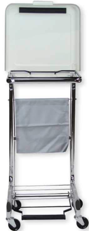
Secure Care Hamper Pouch