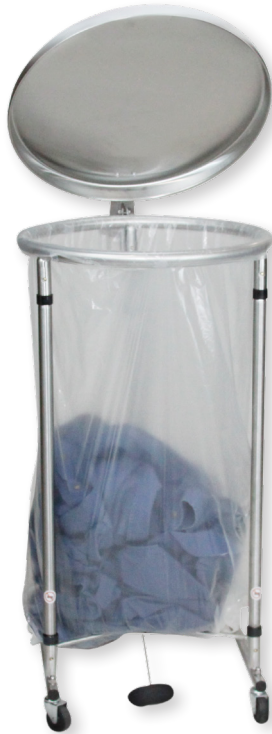
Disposable Water Soluble Plastic Hamper Bag