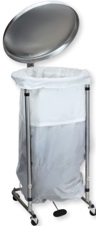
Reusable Nylon Hamper Bag