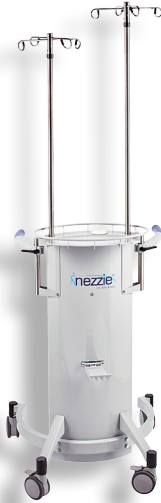
NEZZIE JR. #NZ9100

DIMENSIONS AND WEIGHT: 27 13/16" (width) x 26 3/8" (depth) Height of IV Poles: 52" - 83" Height of Handles: 33 3/8" - 38 7/8"